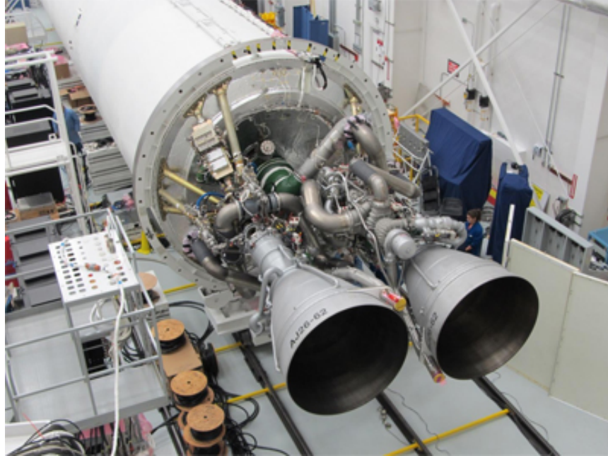
Figure 4. Antares First-Stage Core with Two AJ26 Engines Installed