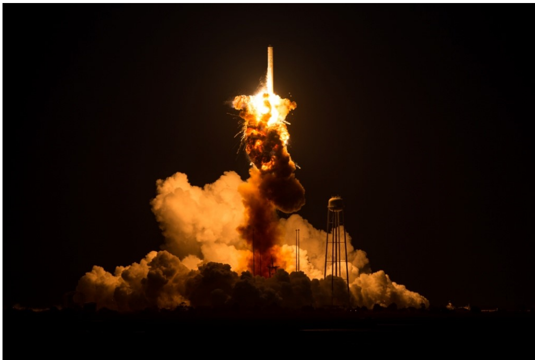
Figure 1. Antares Failure during Orb-3 Launch

Just over 15 seconds into flight, as shown in Figure 1, an explosion in the Antares Main Engine System (MES) occurred, causing the vehicle to lose thrust and fall back toward the ground. Just prior to Antares impacting the ground, range safety personnel issued a destruct command to the Flight Termination System to minimize the potential damage from the expected ground impact and ensuing explosion of the vehicle. The launch vehicle impacted near the launch pad resulting in loss of the vehicle and cargo. Although there was damage to the launch pad and adjacent facilities and buildings, there were no injuries to members of the public or workers involved in the launch. Figure 2 shows the condition of the launch pad on the day following the accident.