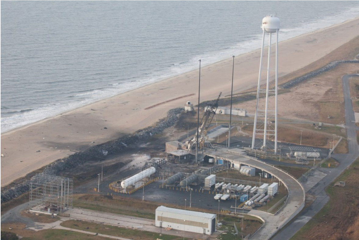
Figure 2. Antares Launch Pad Damage Following the Orb-3 Accident

Immediately following the accident, Orbital ATK established an Accident Investigation Board (AIB). Consistent with the NASA Contingency Action Plan, which had been approved by NASA and the Federal Aviation Administration, which approved the commercial license for the Orb-3 mission. Representatives from the ISS Program were invited to participate as representatives on the AIB.